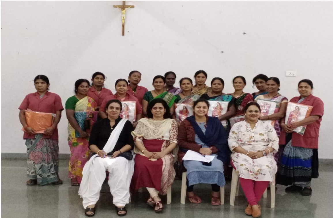
Faculty Staff Coordinators along with housekeeping staff