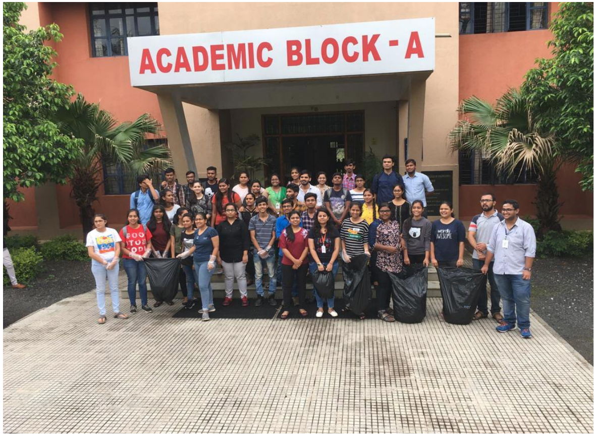
Faculty Coordinators and NSS Student volunteers