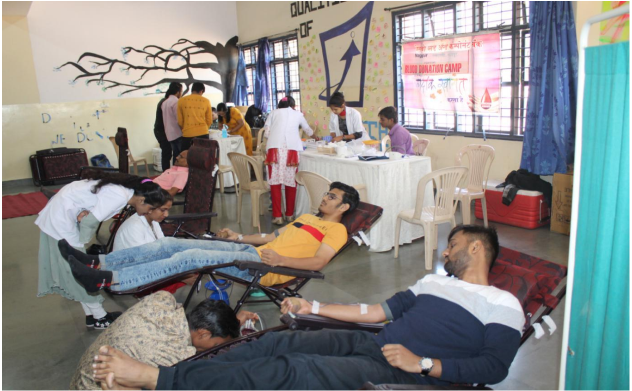
College Students Volunteers