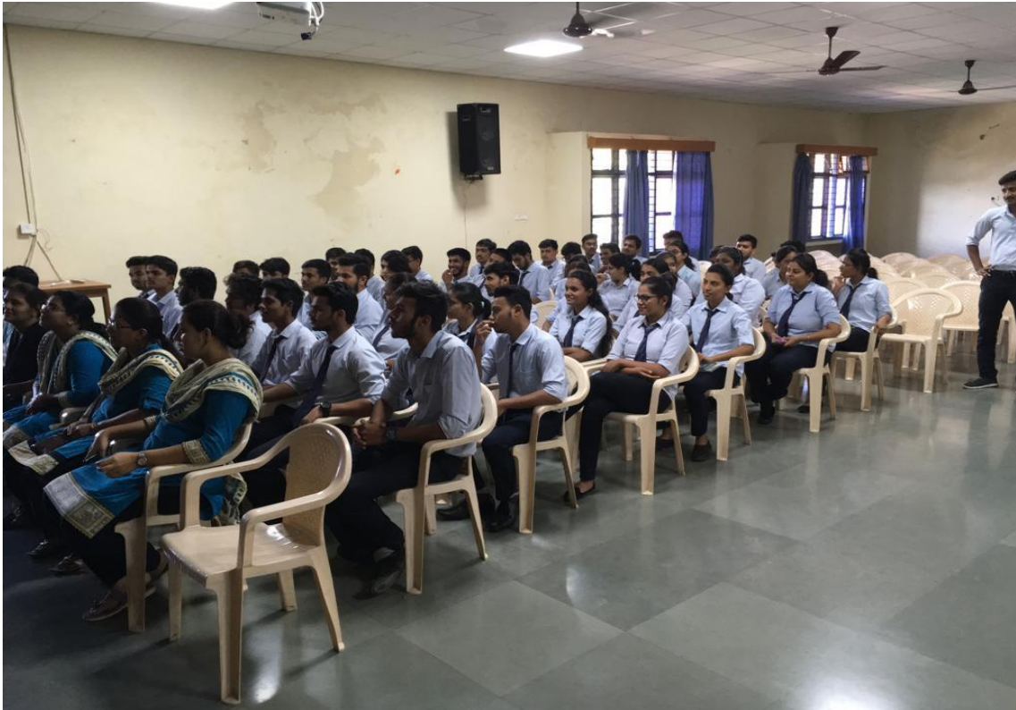
NSS Student volunteers