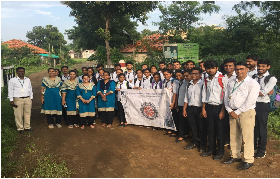
Staff members and Student Volunteers at Ashokwan