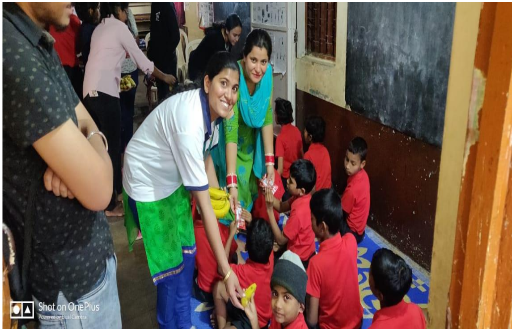
IT NSS Coordinators along with School Children's