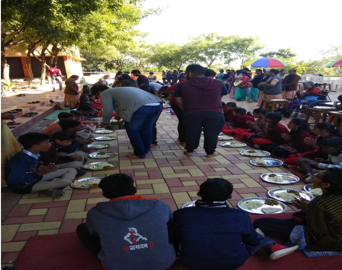
NSS student volunteers