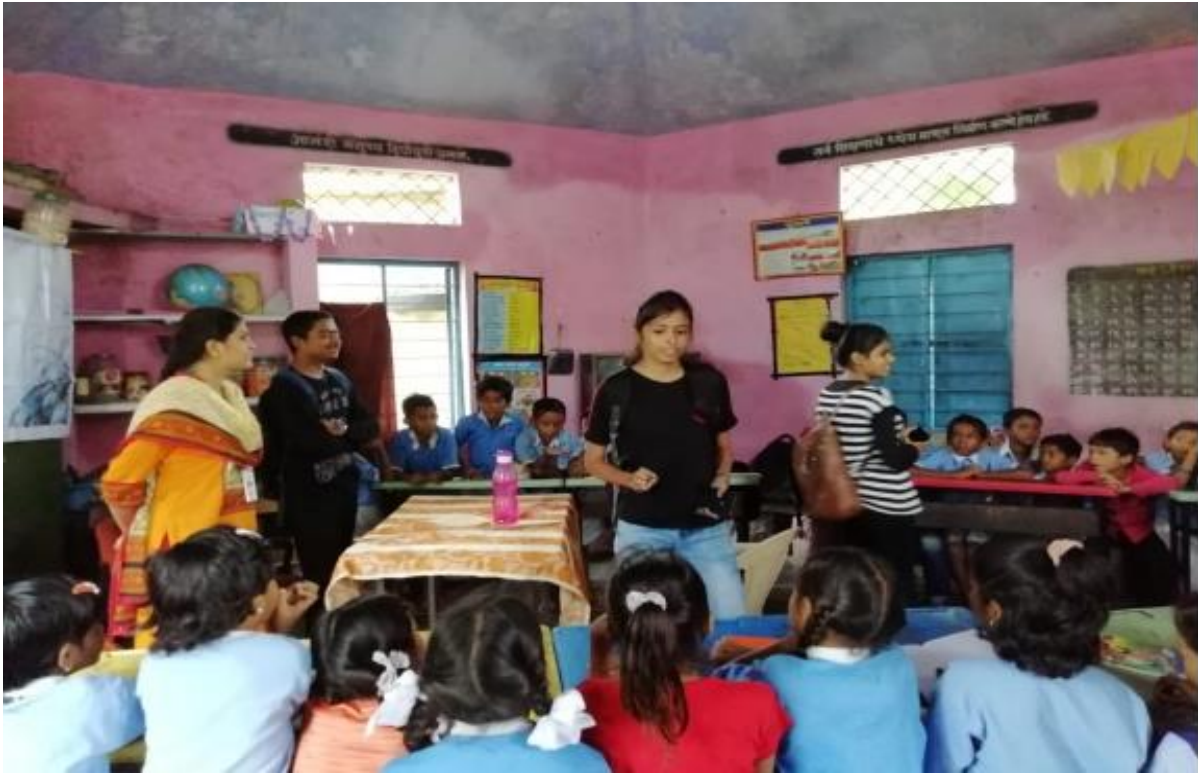
IT NSS Coordinators along with NSS Students Volunteers