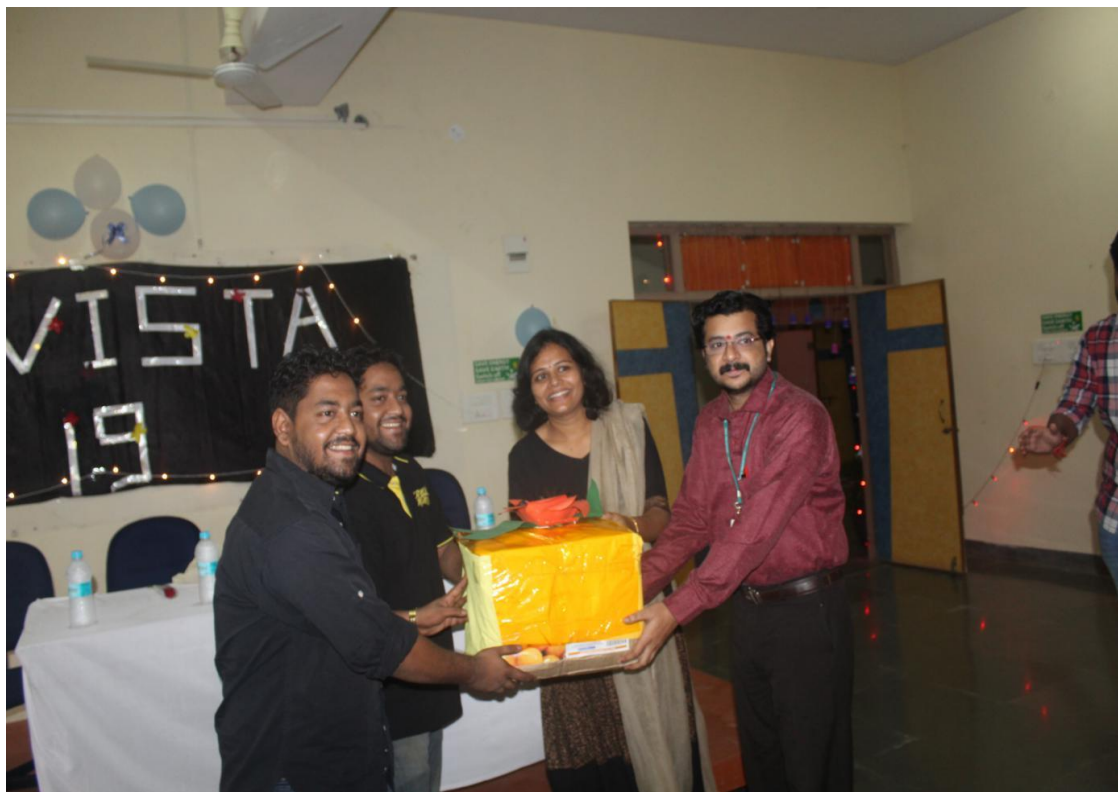
Handover the Food item for Director Friends For Care