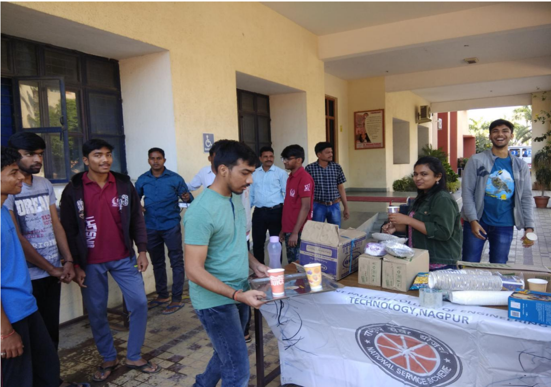
NSS Student V