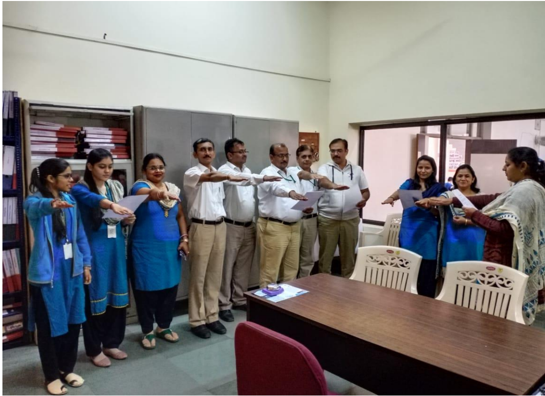
Computer Engineering Department Faculty, & NSS Faculty Coordinators were reading Indian Constitution Preamble