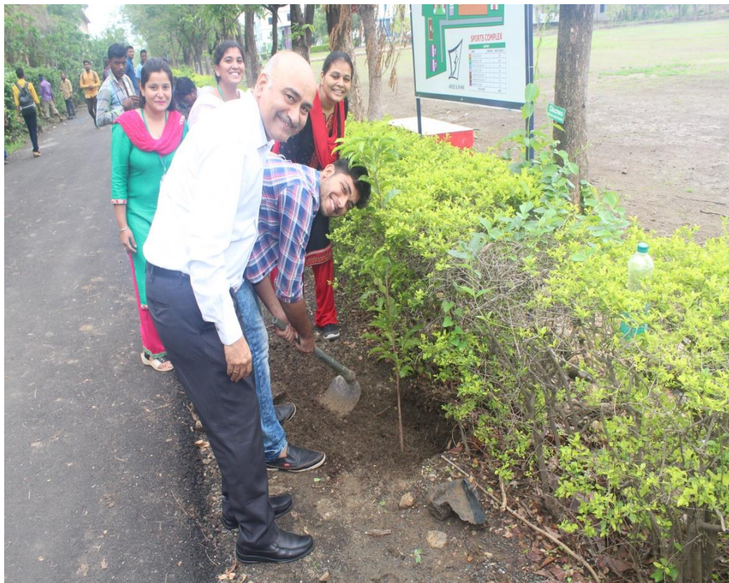
Vice Principal along with NSS staff & Volunteers Students