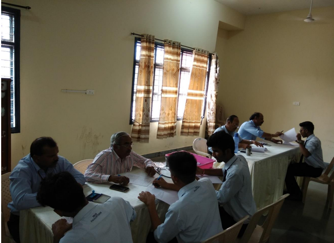
Team of Doctors Examining Boys Students