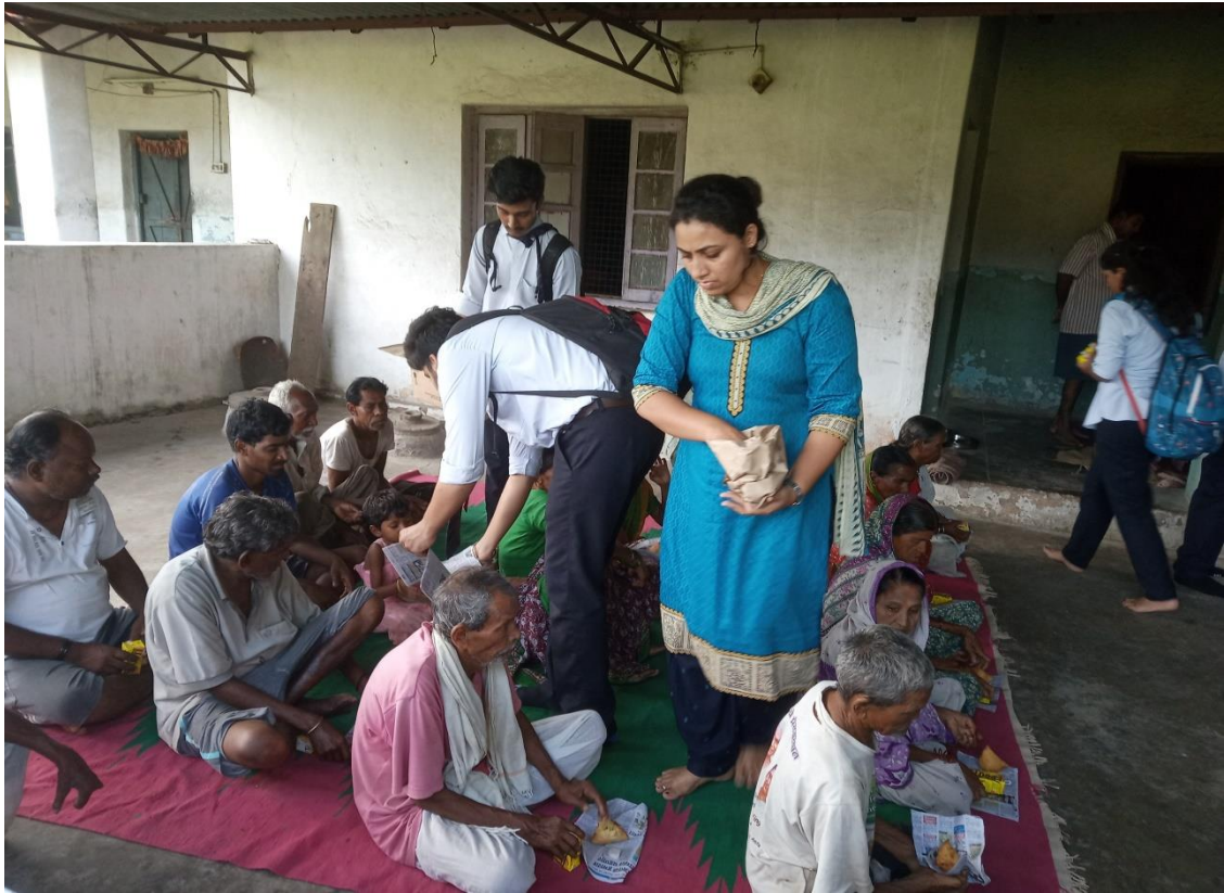
Staff members and Student Volunteers distribute food items