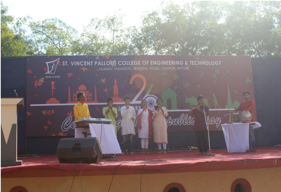
Student perform patriotic Song