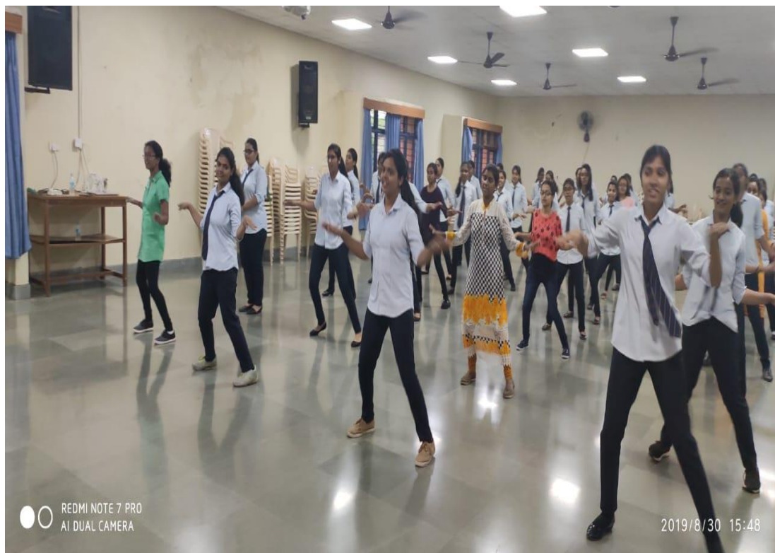
Student doing the zumba session