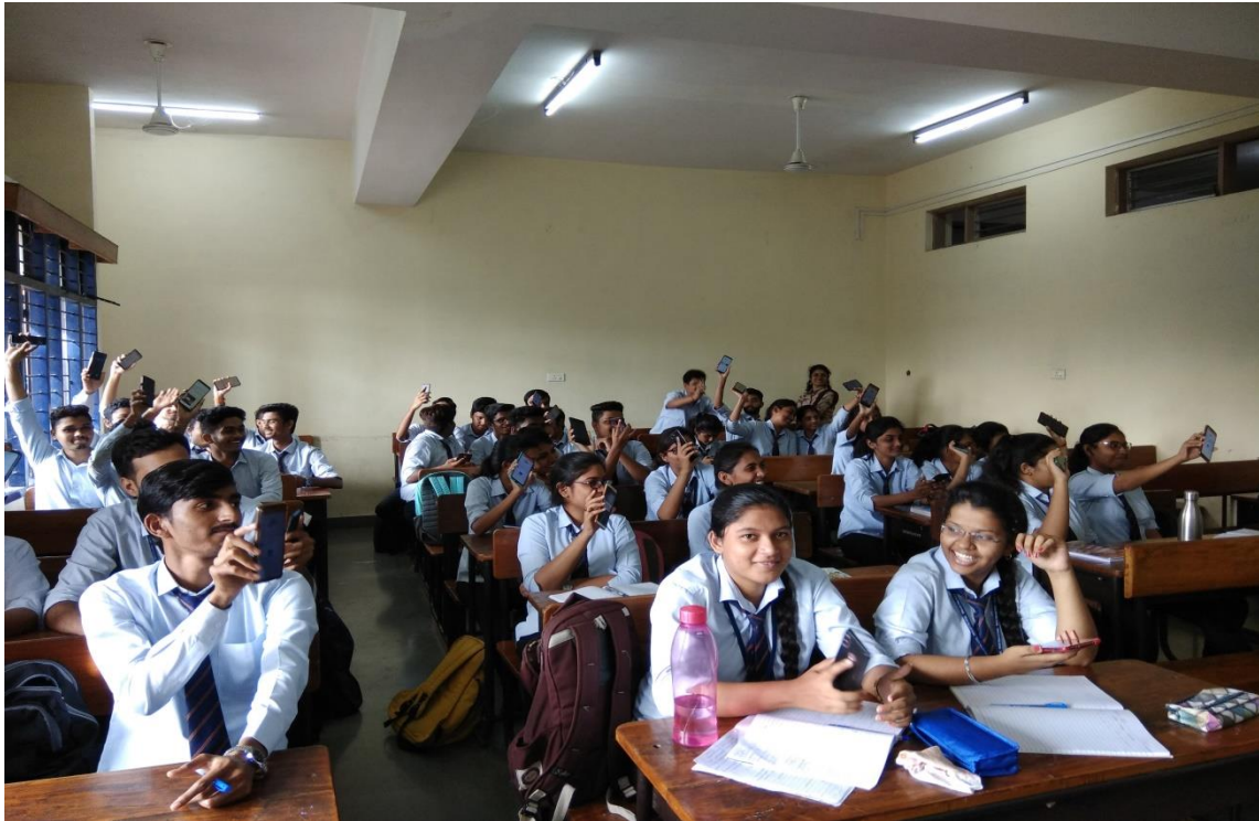
Student Downloaded the app