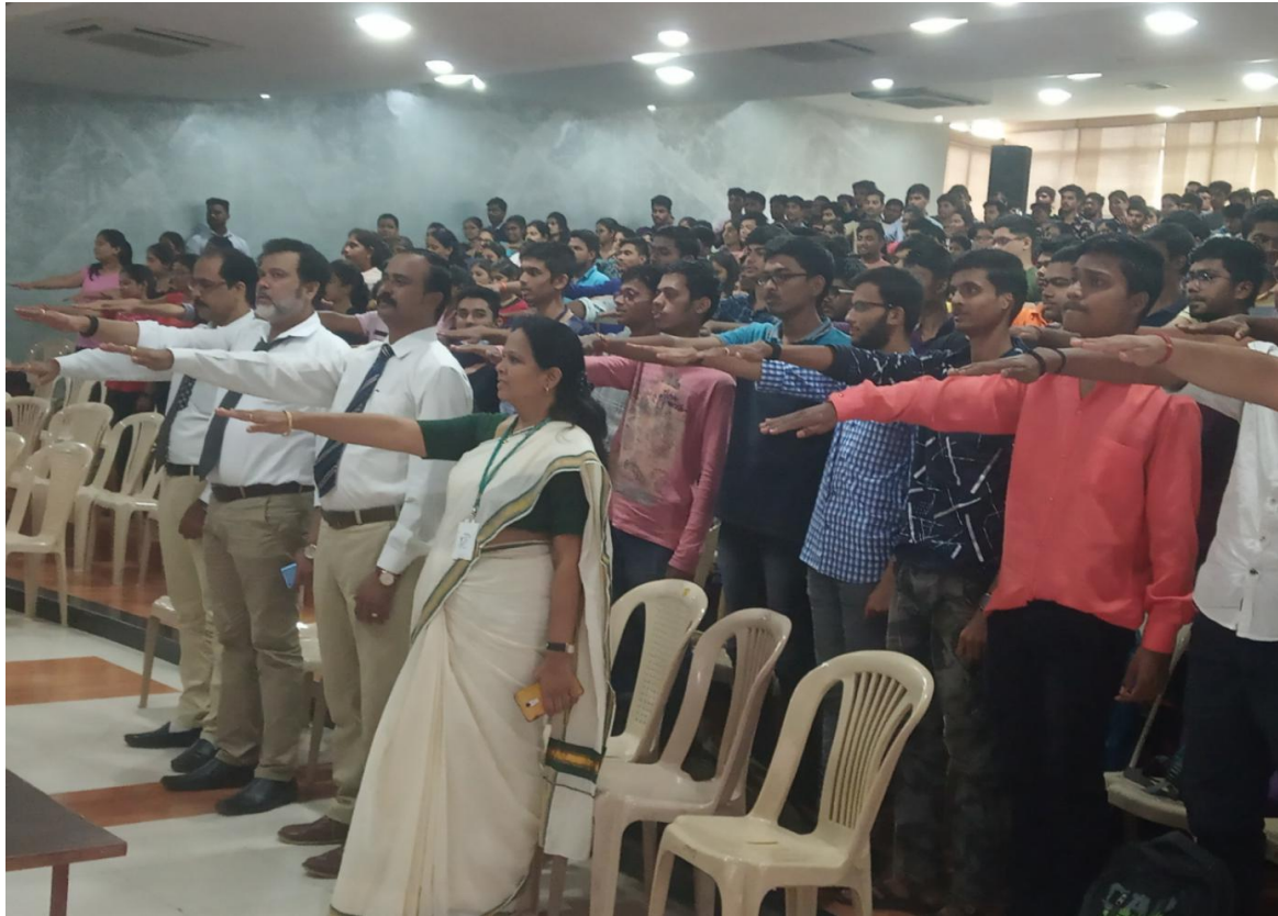
Faculty and Students taking Swachhta Pledge