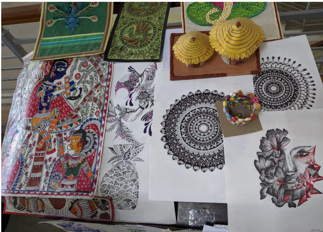
Student Display their paintings and sketches