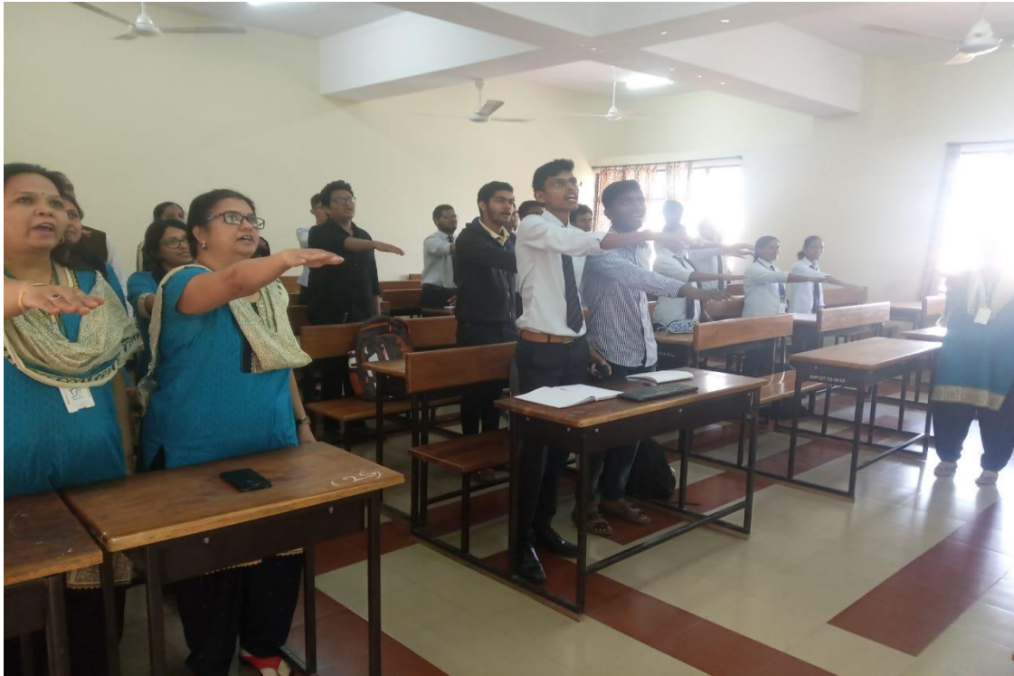
First Year Faculty, Students & NSS Program Officer, reading Indian Constitution Preamble