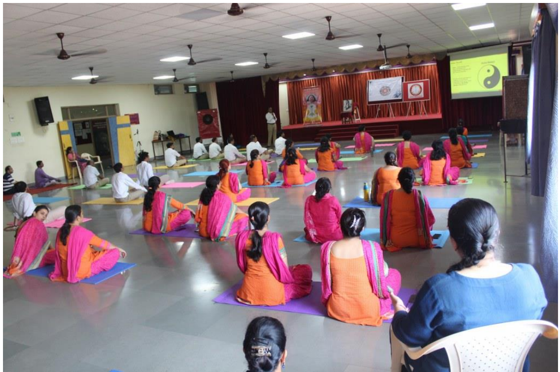
Faculty Coordinators and staff doing Yoga Session