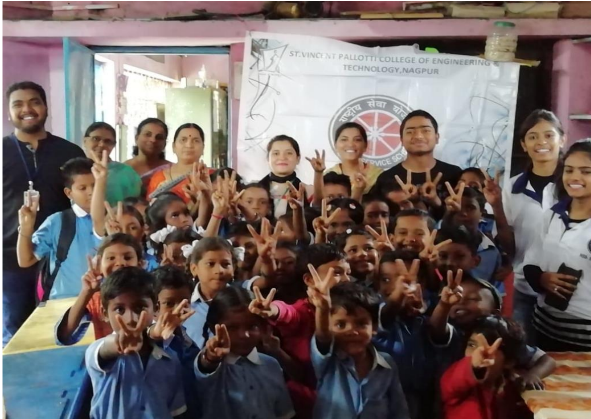
IT NSS Coordinators along with School Children's