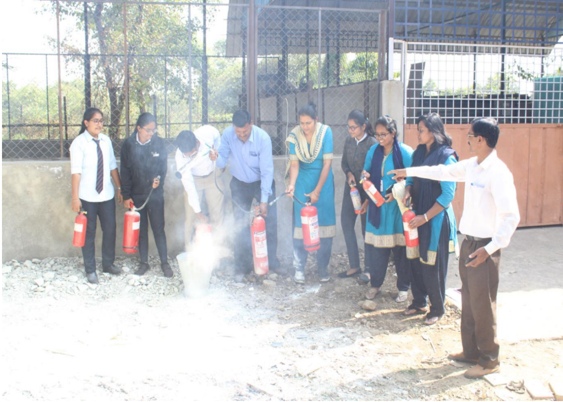
Teaching and Non Teaching Staff does the actual demonstration