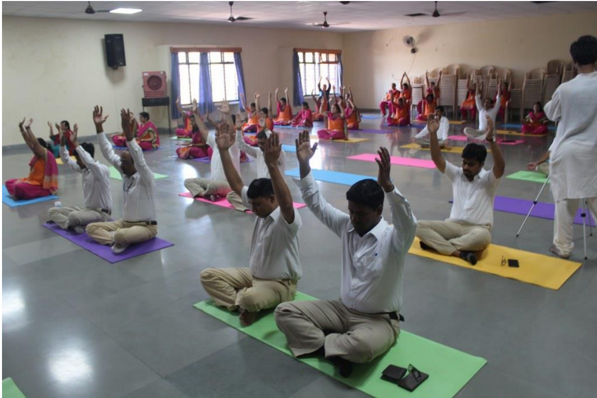
Faculty Coordinators and staff doing Yoga Session