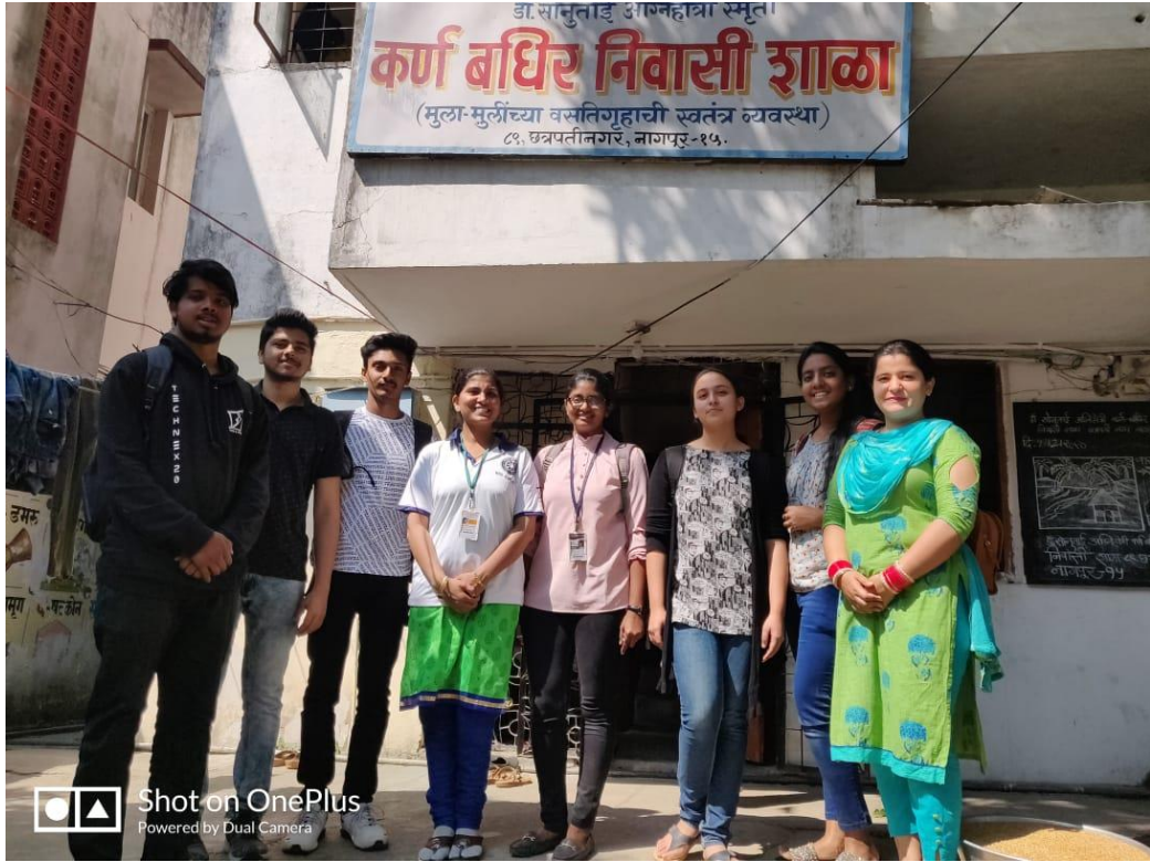
IT NSS Coordinators along with NSS Students Volunteers