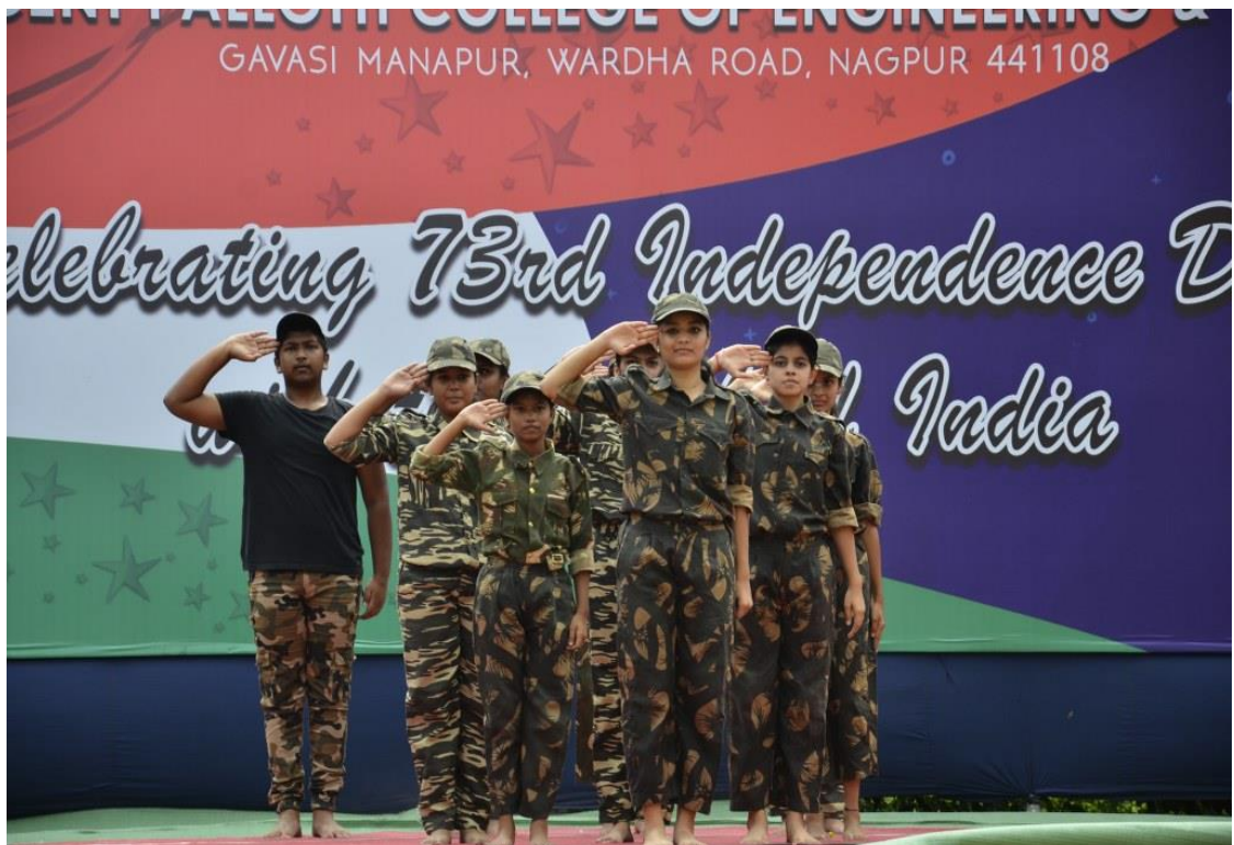
Dance performance by First Year Student