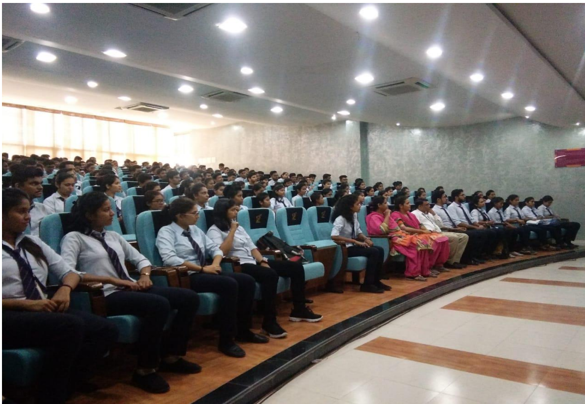
Students and Faculty Members