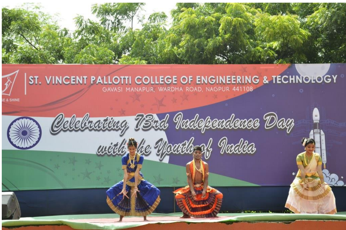
Dance performance by Student