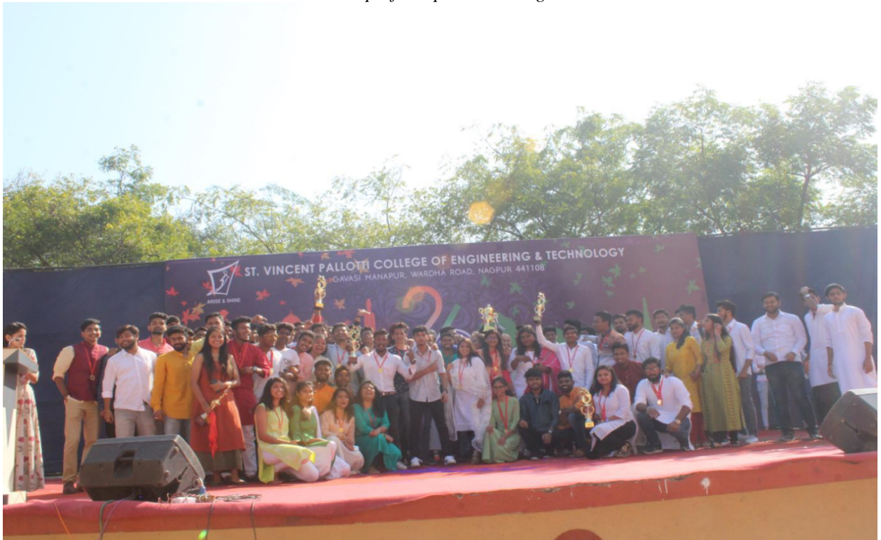
Insight 2020 Sports Winner Mechanical Department Students