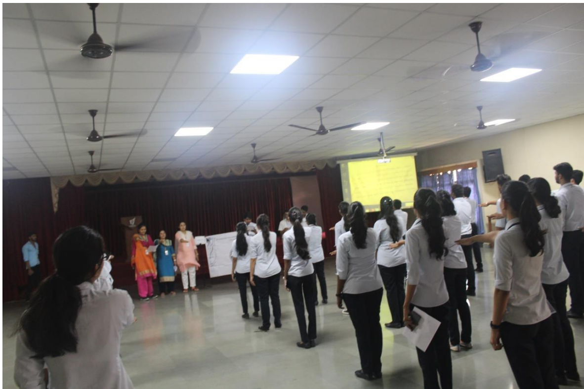
NSS Student Volunteer giving Tobacco Control Pledge