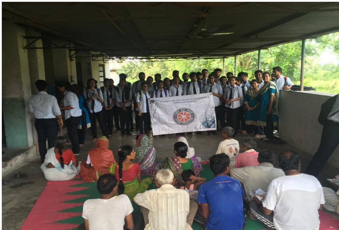
Staff members and Student Volunteers at Ashokwan