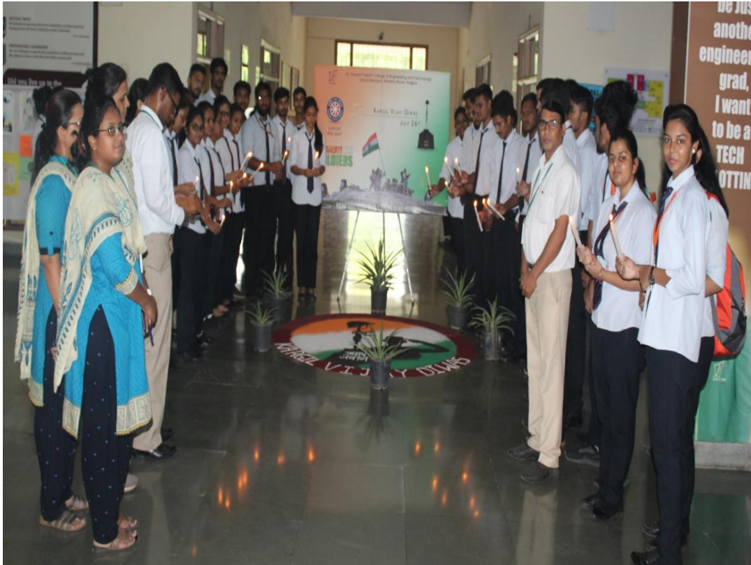
Staff Coordinators and Student Volunteers are observed silence and prayed for all the martyrs and there family members and lit candles to pay homage to them