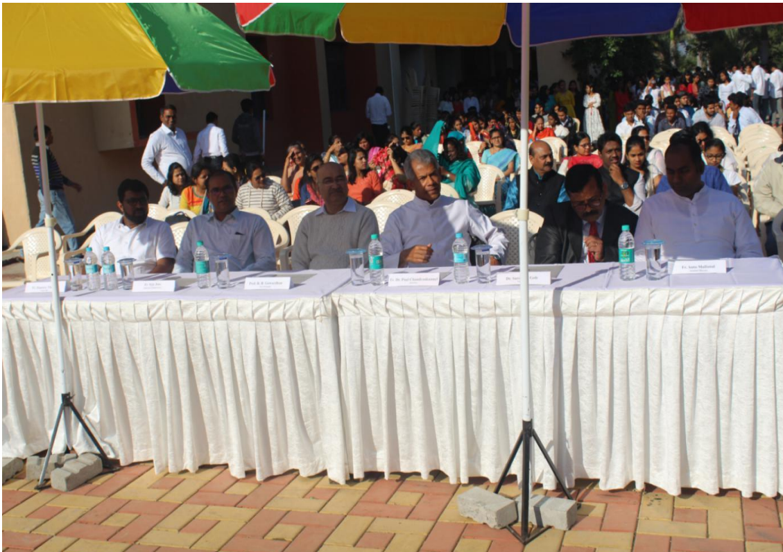
College Dignitaries, Staff and Students During Republic Day Function