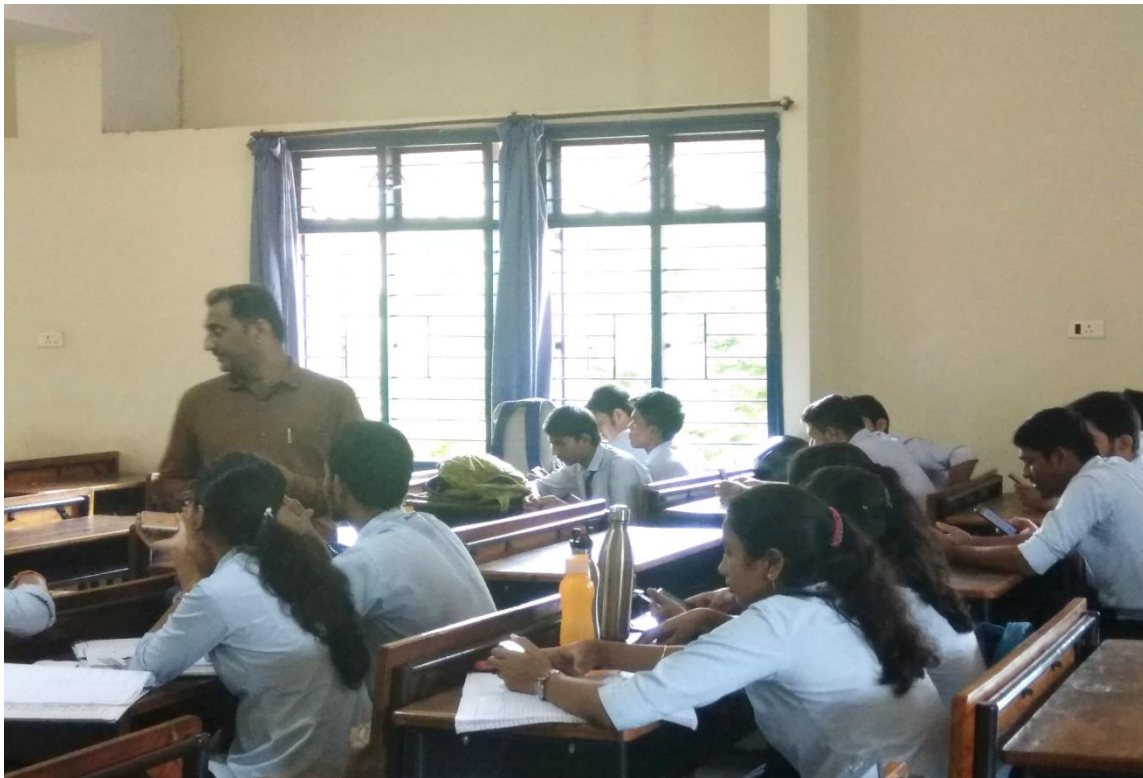
Zilla parishad team interactive the Student