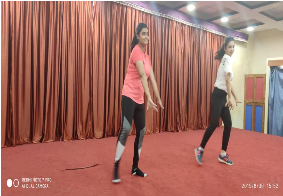
NSS Student volunteers