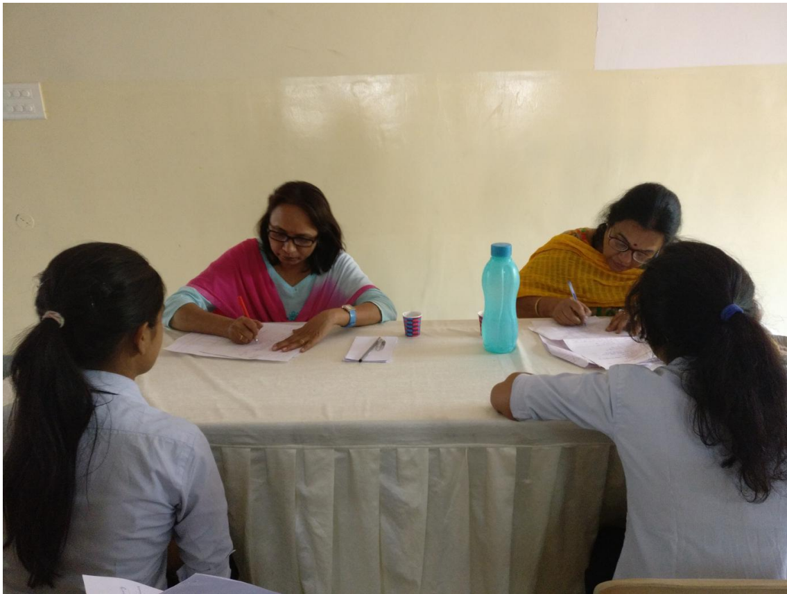
Team of Doctors Examining Girls Students