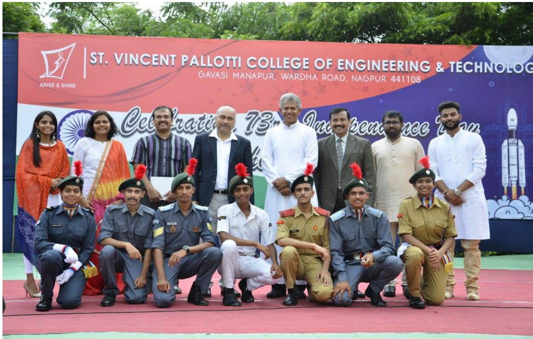
Dignitaries, Staff Coordinator and Student Volunteers after Celebration