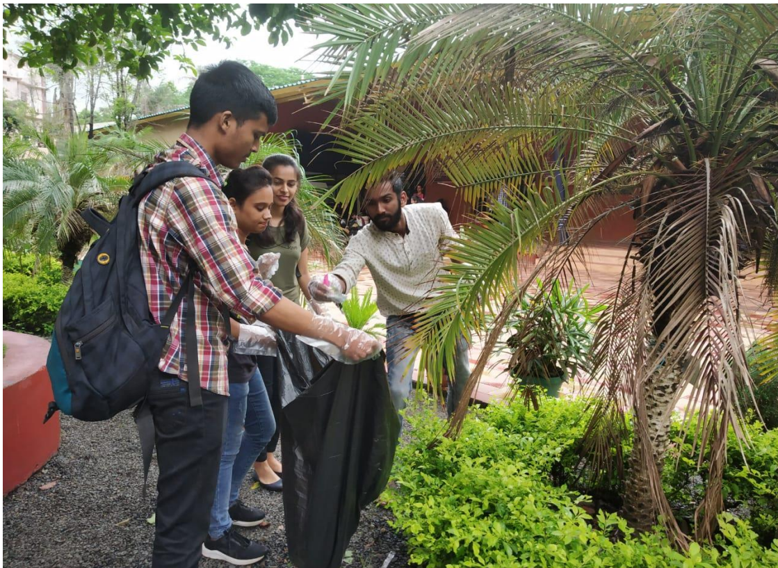
Student volunteers collecting garbage on college campus