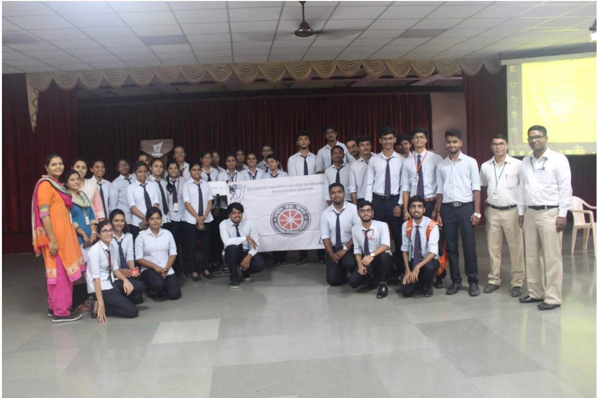
Group photo NSS Faculty members along with NSS Student Volunteer