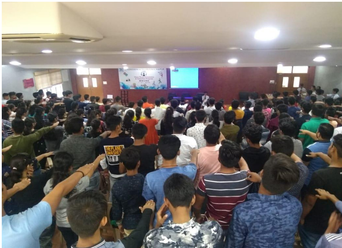
NSS Student Volunteer giving Swachhta Pledge to First Year Student