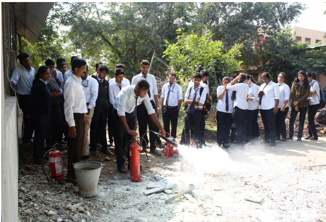
Student does the actual demonstration