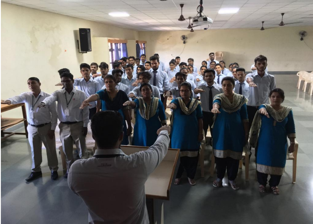
Students and Faculty Coordinators taking Swachhta Pledge