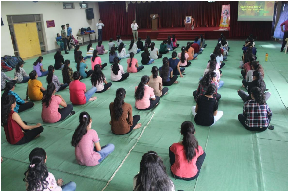
Students and Faculty Members doing Yoga