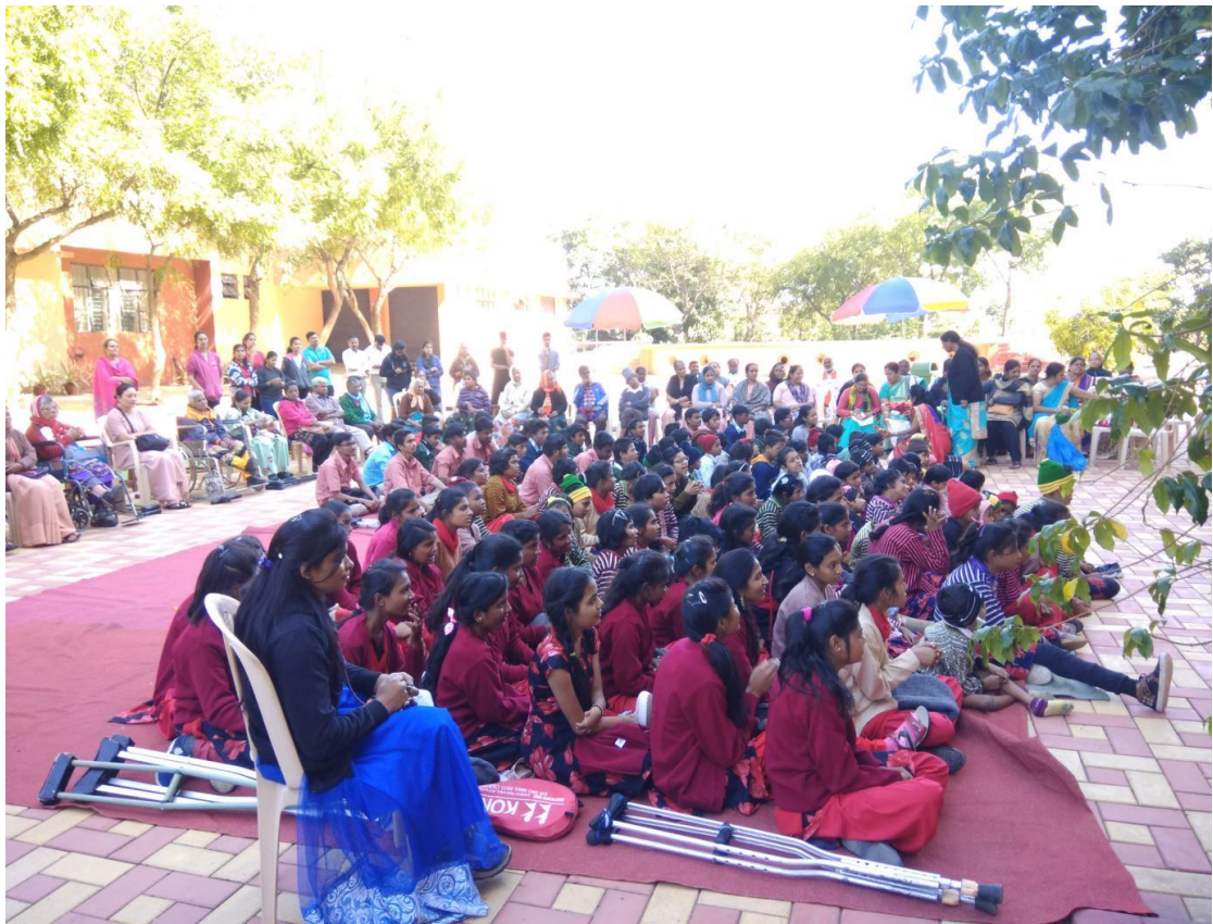
Inmates Home from Aged & Handicapped students