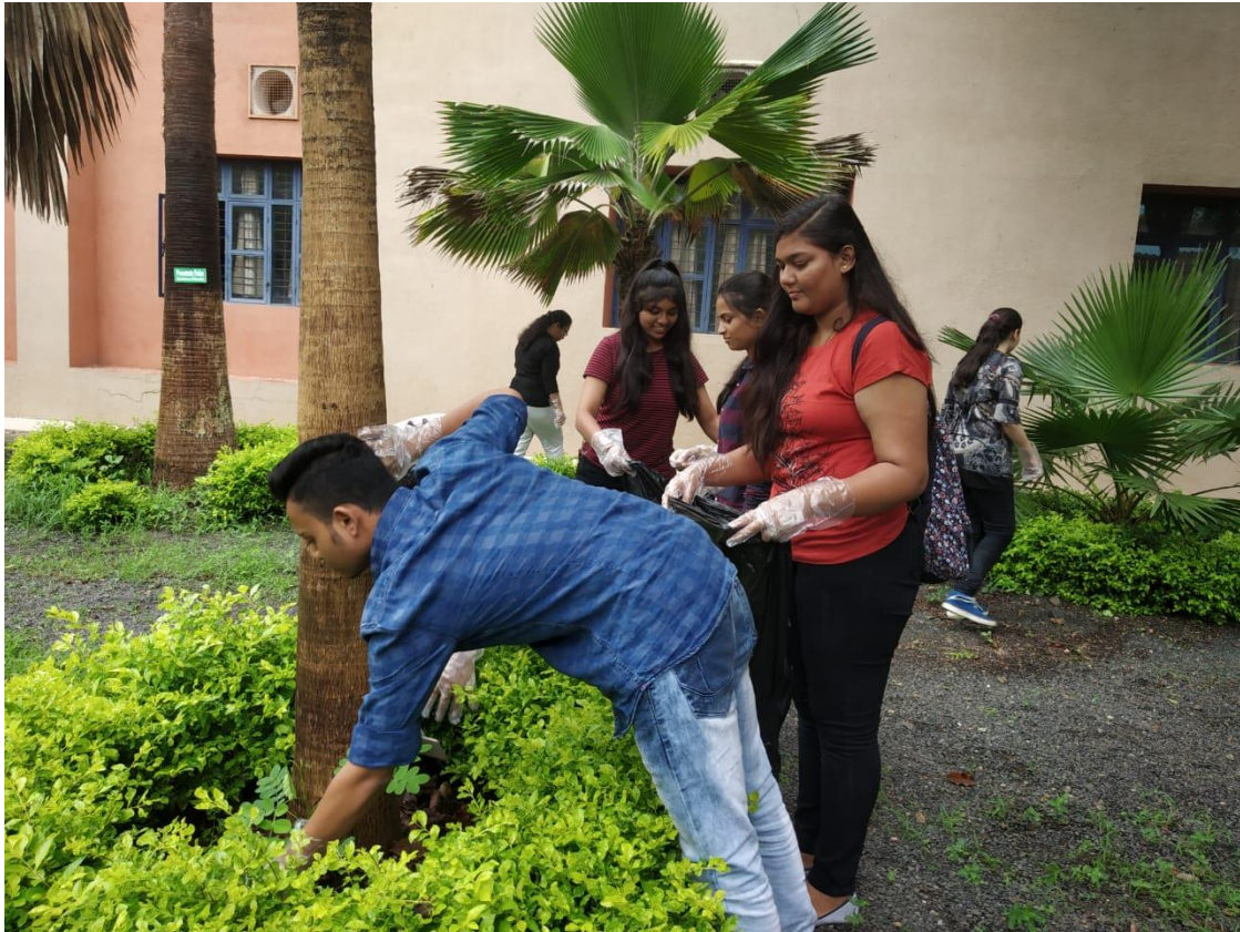
Student volunteers collecting garbage on college road