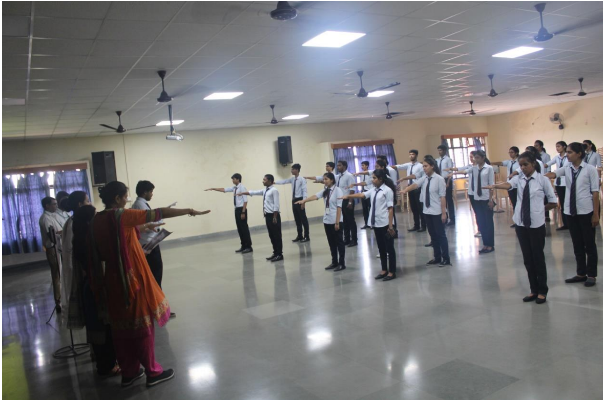
Students & NSS Faculty members taking Tobacco Control Pledge